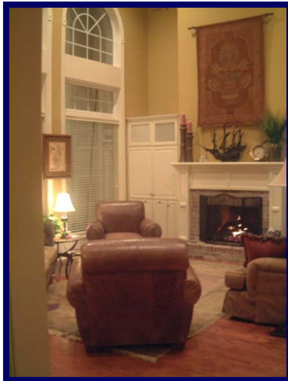
Soaring Ceilings make for a large comfortable great room perfect for entertaining.