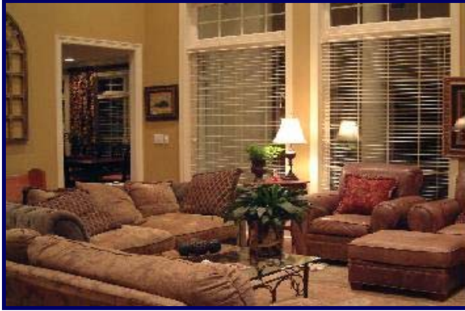
Open and Airy Foyer leads to the Formal Dining Area, Spacious Living Area and 3 of the 4 Bedrooms in this waterfront home.